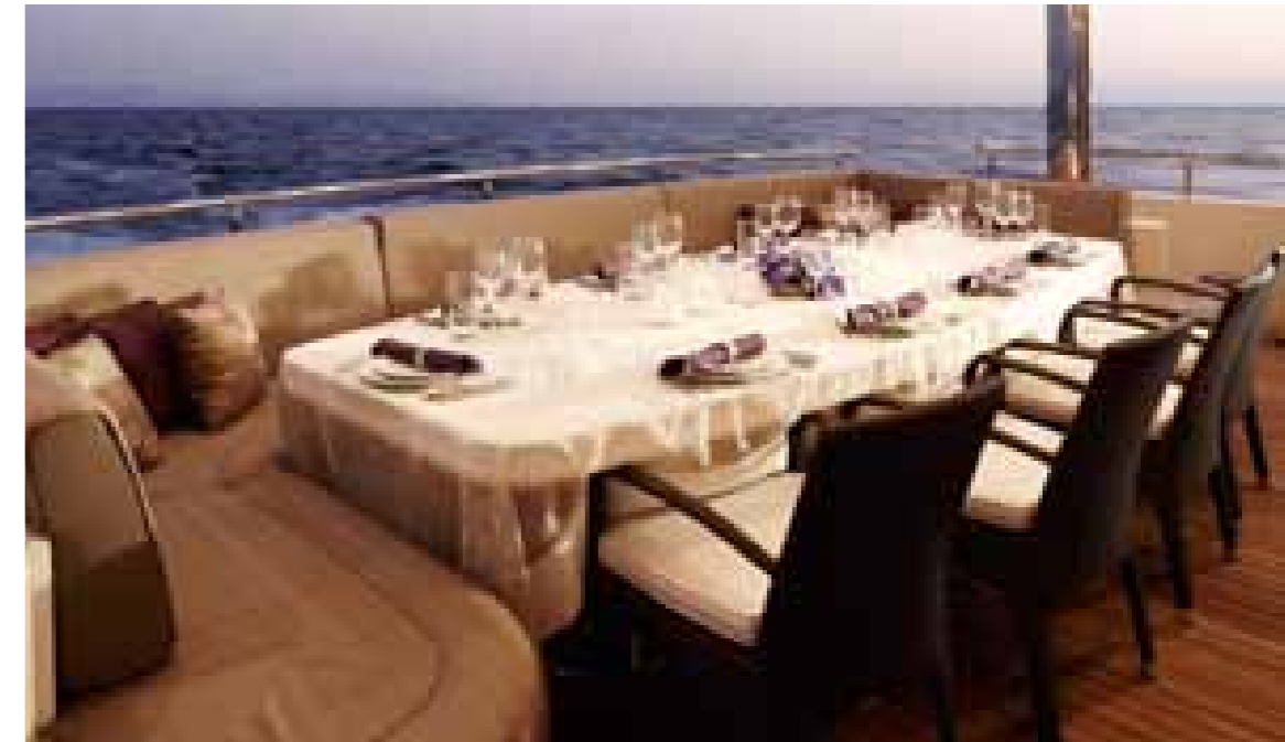
Left: The dining room forward of the main salon allows for more formal dining inside. The yacht carries over 200 wine glasses in 11 hand-crafted storage drawers. Above: The table set for an informal lunch on the upper deck aft. Facing page, top: This cosy leather reading sofa in the main salon is a great place to enjoy a book. Middle: The coffee table is made of wood, lacquered paint and glass, and flanked by leather chairs and sofas. Bottom: Glass ceilings draw light into the lobby.

white leather easy chairs from Moroso and sofas finished in white Kravet fabric, while comfortable leather chaise longues line the starboard side. The lighting is also multifunctional, providing an intimate and warming ambience. The artwork that adorns the boat is decorative yet not overdone, and glass and mirrors are positioned to give the yacht a depth of field that makes her interior feel larger. Life below decks exemplifies how accommodation for crews should be laid out and finished – E&E’s owner evidently wants the crew who serve him to do so happily. Spacious, well lit and comfortable, this carefully planned area puts many larger yachts to shame. The crew have the entire lower deck to themselves and there is plenty of storage, as well as large service areas and recreational spaces for the crew to enjoy in their off-duty hours. The exterior of the yacht is equally functional, with full walk-rounds on both the upper and bridge decks that give E&E a ‘big boat’ feel. High bulwarks at the bow ensure she is safe in heavy weather: this yacht could shrug off all but the most malicious waves. The Portuguese bridge forward of the wheelhouse is a sweetly intimate spot for breakfast. On the same deck