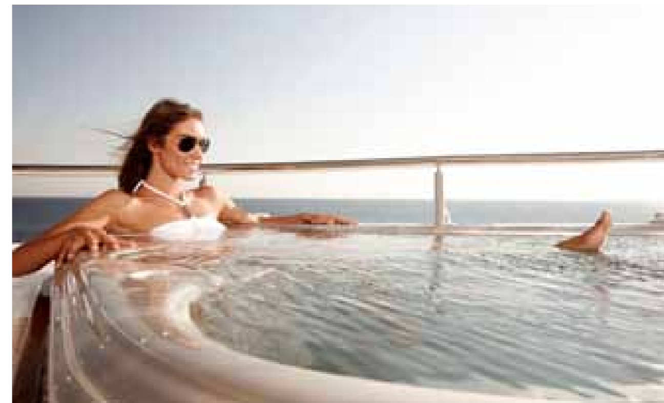
Left: Safer and more family friendly than a PWC, the water buggy with its 10hp Honda outboard motor is cute and easy to use. Above: Hedonistic pleasures abound on board this yacht – the upper deck hot-tub is just one of them.