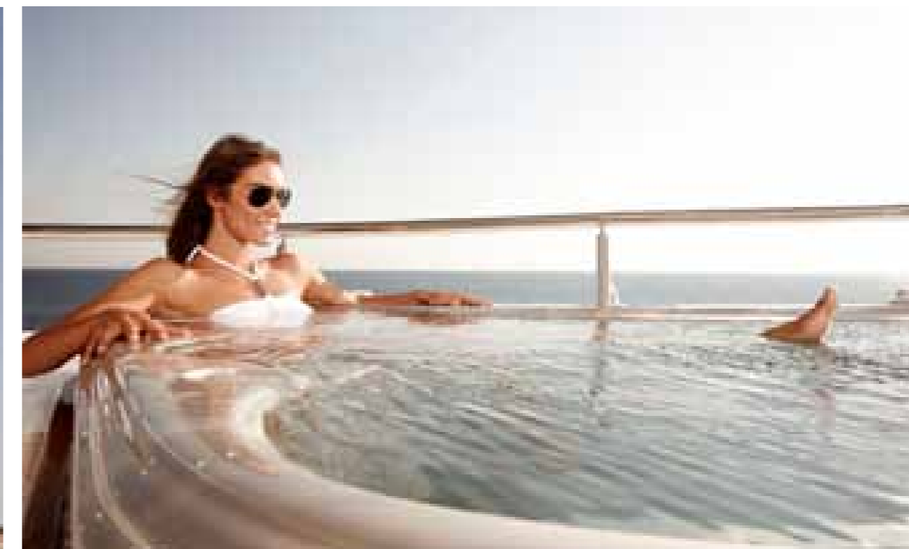
Left: Safer and more family friendly than a PWC, the water buggy with its 10hp Honda outboard motor is cute and easy to use. Above: Hedonistic pleasures abound on board this yacht – the upper deck hot-tub is just one of them.