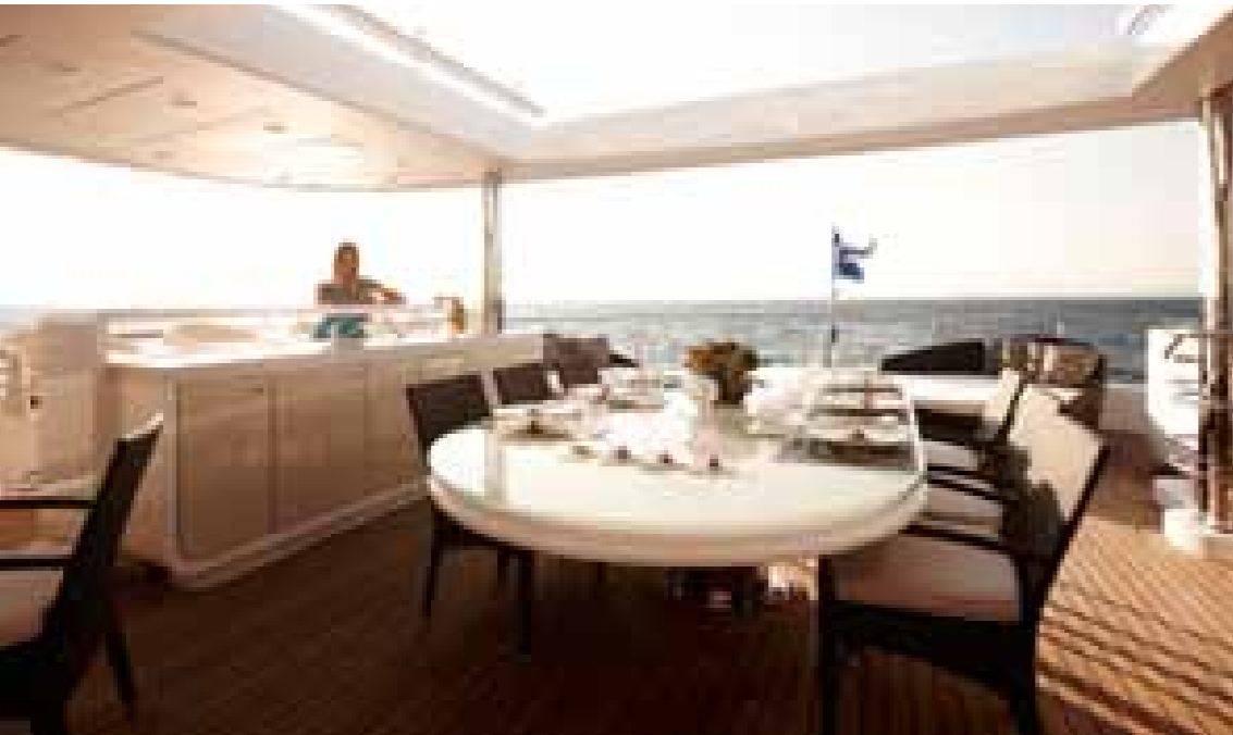
Right: The observation lounge with its club-like wooden panelling is also the games room. Above: With the touch of a button, the roof of the upper deck aft slides away to create an open-topped dining room on deck. Facing page, top: Maintenance is reduced with stainless steel instead of teak handrails. Middle: Guest cabin doors open onto the side decks, as in old ocean liners. Below: Well-planned guest cabins located above the waterline give this yacht an edge for chartering.

different, with innovative touches such as glass floors, off-white leather, decorative paint finishes and Indian apple woodwork finished to a high gloss. Sculptured wall murals, also in glass, set the contemporary theme, and although the heavy use of onyx and splashes of gold jar in some yachts, here they blend tastefully.