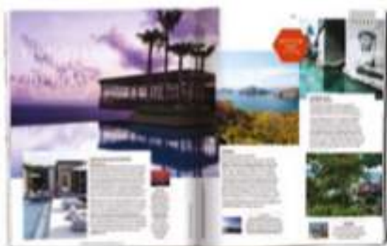
164 A selection of the world's best spas a tender ride away