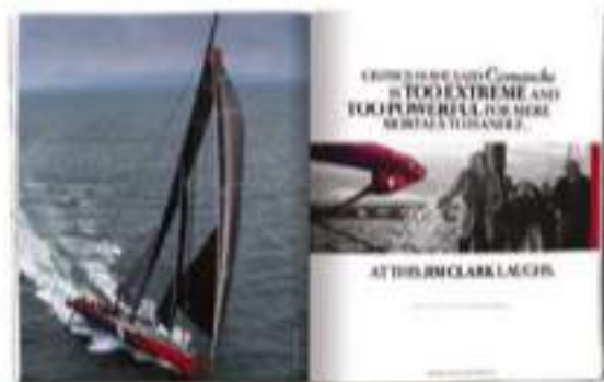
146 Jim Clark's super maxi Comanche isn't for mere mortals