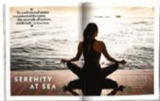
122 Read our guide to enlightened charters and...relax