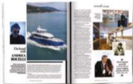
76 Andrea Bocelli sounds off about his off-stage passions