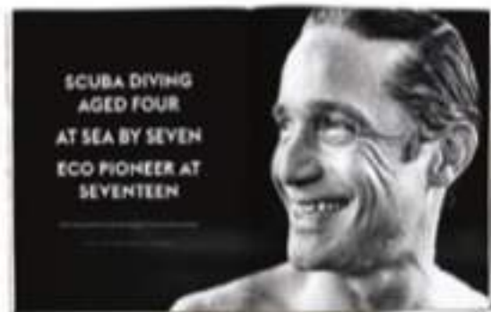
140 Fabien Cousteau steps out of his grandfather's shadow