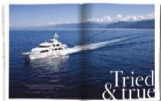
82 The new Delta Onika is ready to take on the world