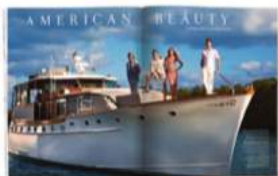
104 Family fashions to own the summer