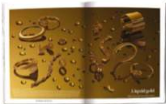
68 Nothing says glamour like gold bracelets and bangles